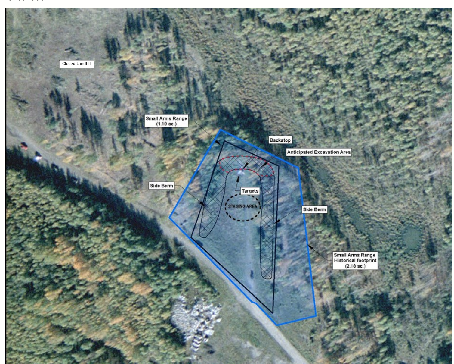
Figure 2: Map of Small Arms Firing Range.

The duration of the TCRA is expected to be less than six months. Field work is anticipated to begin in July and is expected to be completed by August 2015.