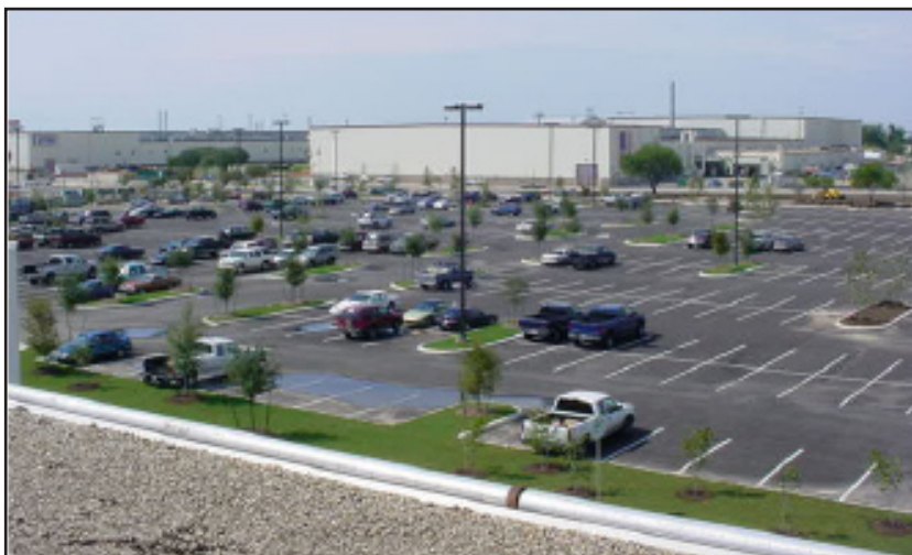
Parking lot of Building 301 where the system will be installed.