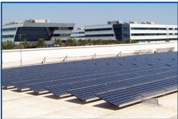
Photovoltaic Roof Project at Los Angeles AFB, California

Commercial Power Purchase: The purchase of renewable electricity from a private developer with delivery through the local utility grid is a commercial power purchase.