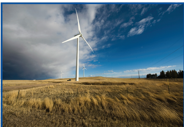
Wind project at F.E. Warren AFB, Wyoming