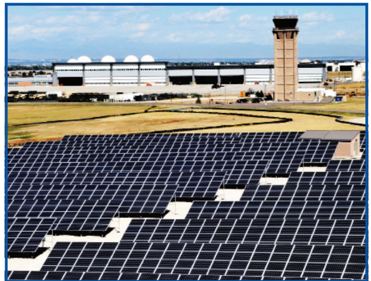
Photovoltaic Array at Buckley AFB, Colorado

Economics: Savings-to-investment ratio, state incentives, and the current cost of electricity are all considered when evaluating renewable projects. If a given installation currently pays $0.02 per kWh, building a renewable energy project that will result in $0.12 per kWh cannot typically be justified.