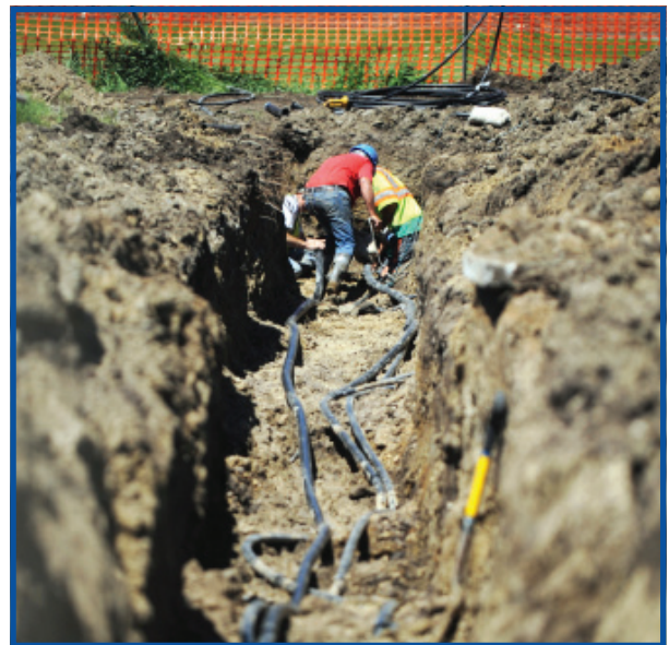
Geothermal Project at Minot AFB, North Dakota