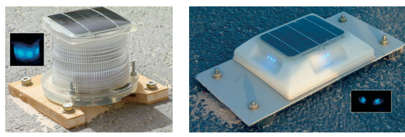
The photos above display the round (left) and flat (right) solar-powered LED lights employed in Iraq. The inset in each photo shows how the lights look after dark.

Author's note: While the LED lights used in the setting described in this article are appropriate for use in some contingency situations, such as the one recounted in this article, they do not meet Air Force requirements for permanent fixed base operations. Should the need for blackout arise, the LED lights described in this article must be individually turned off and reactivated manually, using a magnetic device.