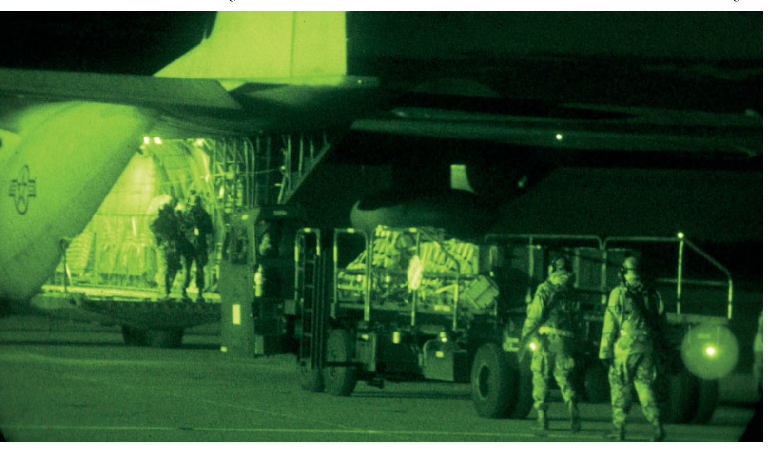
Members of the 615th Air Mobility Squadron, Travis AFB, Calif., and a C-130 aircrew from the 34th Combat Training Squadron, Little Rock AFB, Ark., perform an engine-running onload/offload at night on Naval Air Engineering Station Lakehurst, N.J., during the Air Force's newest contingency exercise, Eagle Flag.