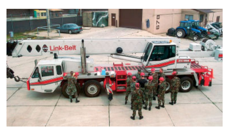
PACAF 'dirt boys' get crane operator certification training at Osan AB.

and funding requirements over time and between bases. Other infrastructure areas, such as storm water, roofing, roads and fire protection, are now added on request but are treated as special interest areas.