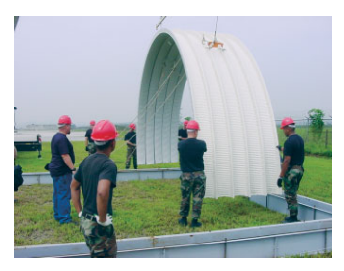
PACAF structures troops learn how to erect K-span facilities during vendor training at Osan AB, Republic of Korea.