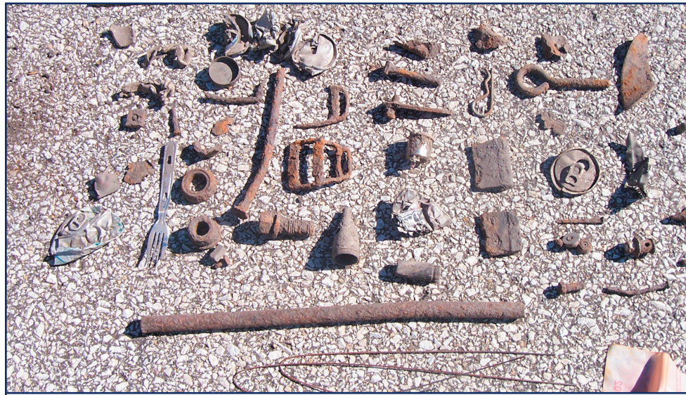
Some of the harmless debris Air Force contractors found buried under a suspected demolition disposal area (DP069).

Air Force contractors also conducted an investigation of the 25-foot buffer zone around the suspected demolition disposal area, leading to the discovery of an additional 60 subsurface