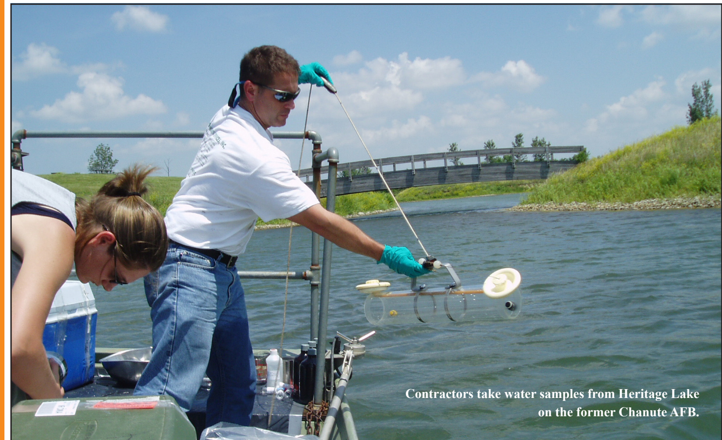
Contractors take water samples from Heritage Lake on the former Chanute AFB.

AFRPA/COO-Kelly 143 Billy Mitchell Blvd., Suite 1 San Antonio, TX 78226-1816