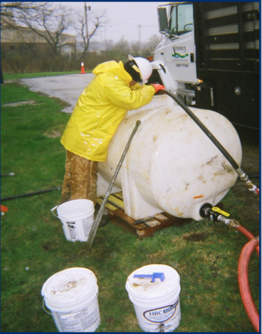
Contractor conducts fieldwork activities at the former base.

The Air Force continues cleanup progress at the former Chanute Air Force Base with several fieldwork activities currently planned or underway. Air Force contractors are continuing groundwater monitoring for the treatability study to test the effectiveness of two types of treatment technologies for groundwater contamination. The data collected during the study may be used to evaluate remedies for groundwater-contaminated sites throughout the base. Additionally, contractors are ready to excavate contaminated soil at Building 1 (Hangar 1) near a former above ground storage tank and remove oil/water separators at Building 933 and in the area of the former Building 711. The three sites are located on the