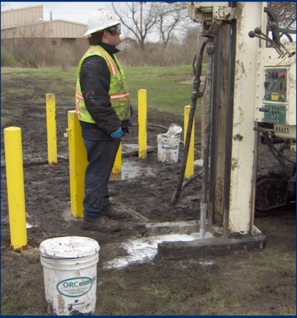
Contractor monitors fieldwork for the treatability study at the former base.

former base and the field activities are described in the applicable correction action plans. The operations, maintenance, and monitoring program for three capped landfills is also ongoing and contractors continue to inspect the cap for erosion, collect groundwater samples from wells that surround the landfills, and test for landfill gas emissions from the vents installed within the cap. The results of the landfill cap monitoring are included in the Chanute Administrative Record at https://afarpaar.afarpa.pentagon.af.mil/ar/docsearch.aspx . To learn more about fieldwork activities contact the Air Force Real Property Agency toll free at 1-866-725-7617.