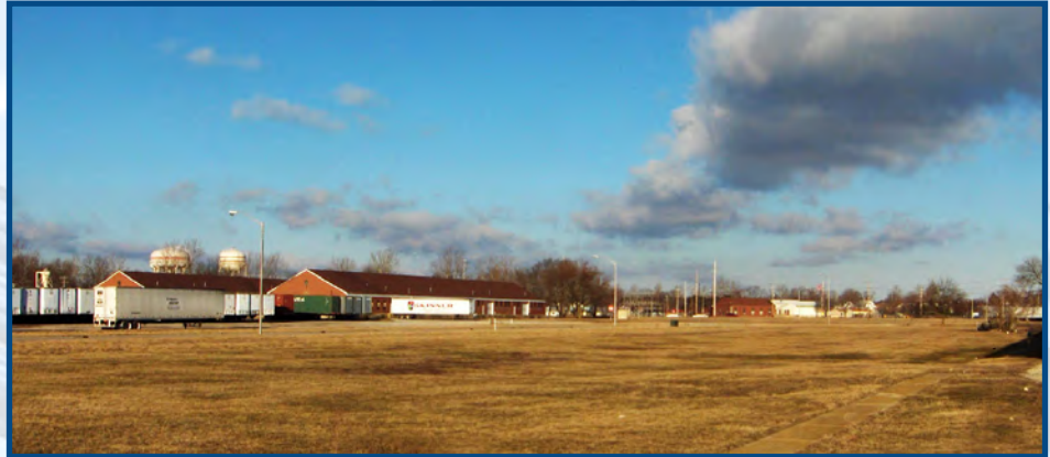
Once excavation is complete and receives regulatory approval, this "Group 7" site, Coal Storage Area 1, will have no restrictions on future reuse.

Some of the sites scheduled for cleanup include the soil underneath the water towers, the former skeet range and two former coal storage areas. Soil excavation is a remedial technology involving the removal of contaminated soil and off-site disposal in an approved landfill. Five of the seven sites will be remediated to levels that allow unrestricted land use (i.e., residential). The other two will be remediated to their designated land use and will require institutional controls. Once completed, all seven sites will be available for reuse with only two requiring future Air Force involvement to monitor institutional controls.