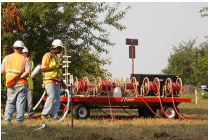
Groundwater cleanup is well underway at the former Chanute AFB.

The phrase “operating properly and successfully” involves two separate concepts. A remedial action is operating “properly” if it is operating as designed. That same system is operating “successfully” if its operation will achieve the cleanup levels or performance goals delineated in the Record of Decision. Additionally, in order to be “successful,” that remedy must be protective of human health and the environment. Thus, U.S. EPA interprets