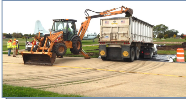
Excavation continues at Skeet Range 1

The additional cleanup to achieve unrestricted closure was implemented under the Air Force's Accelerated Site Completion initiative. The ASC initiative is part of the Air Force's aggressive approach to maximize the number of environmental sites achieving unrestricted closure. Site SS064 is one of 12 sites at the former Chanute AFB identified for additional work. Cleanup at the other sites was completed earlier in