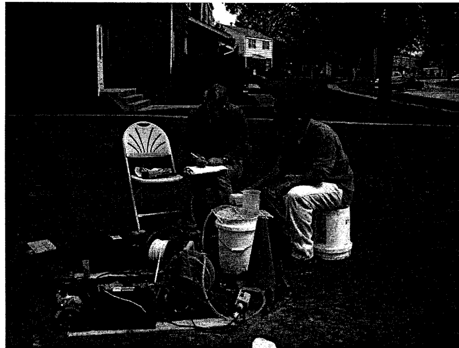
Sampling Monitoring Well at Former Rifle Range