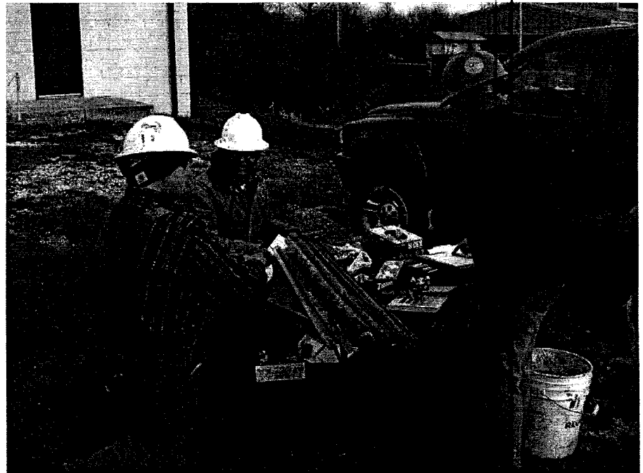
Sampling near Building 927