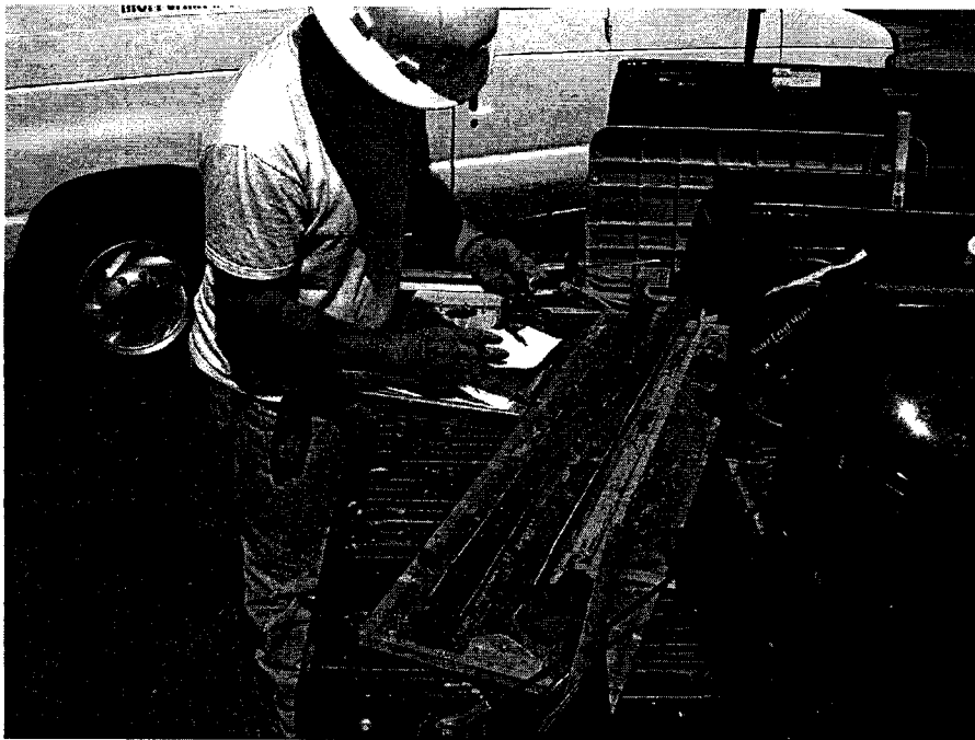
Sampling West of Golf Course Hole #1