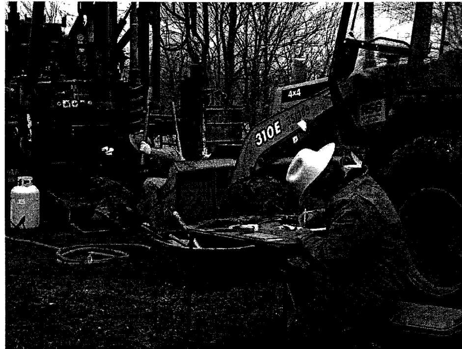
Well Installation near Former Fuels Training