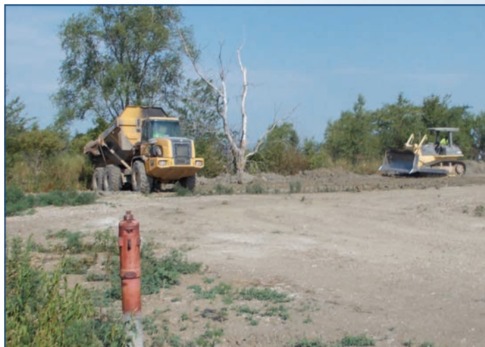
Above: The Air Force's contractor works to backfill the Western Perimeter Ditch at Fire Training Area 2 which is part of Group 8.

for SS066. Both the ROD and the RAWP are anticipated to be signed and approved in September.