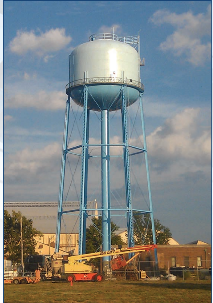
Above: The Air Force considered all safety risks before moving forward with renovations to Tower 44.

Once work is complete, the tower will be disinfected and placed back into service, ensuring the Village has ample water storage capacity well into the future.