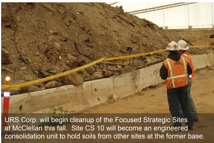
URS Corp. will begin cleanup of the Focused Strategic Sites at McClellan this fall. Site CS 10 will become an engineered consolidation unit to hold soils from other sites at the former base.