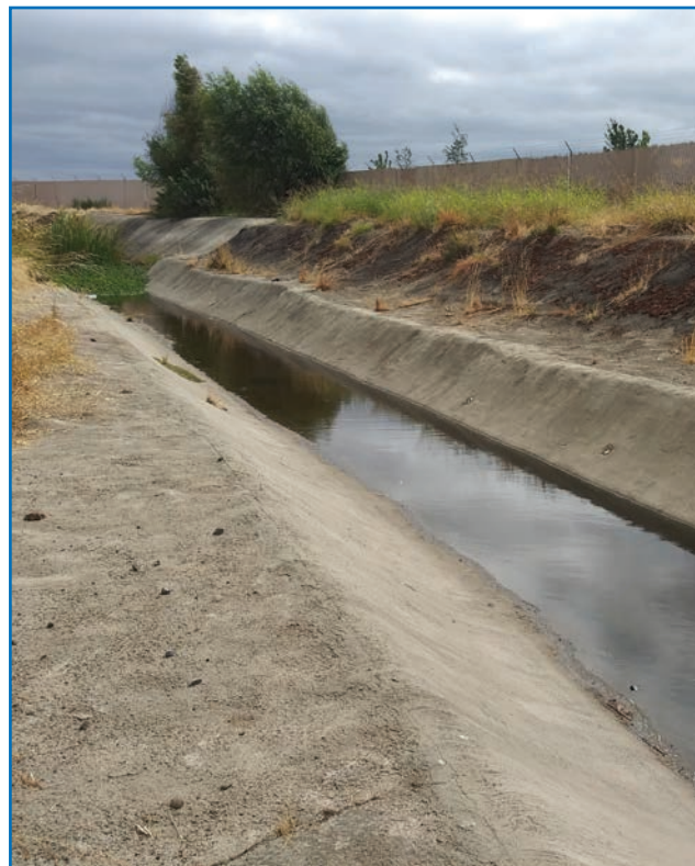
Environmental cleanup is complete at Lots 149E and 159D (located on the west side of McClellan adjacent to Magpie Creek). The Air Force anticipates transfer of the two properties to McClellan Business Park in 2023.