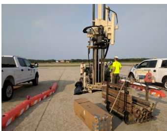
A mobile drilling rig will be used to install monitoring wells.

Drilling and installing monitoring wells: You may see members of our team at a number of locations working with a drill rig, installing monitoring wells or collecting soil samples.